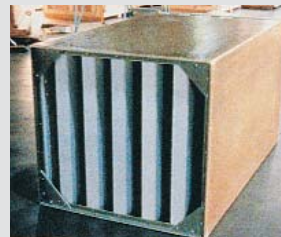
Prefabricated CPI plate rack, designed for easy removal as an assembly.

At the top of the unit, the separated oil forms a layer and is skimmed by an adjustable trough or weir. The clean effluent flows upward through the clear effluent compartment, then over the adjustable effluent weir and out of the separation unit.